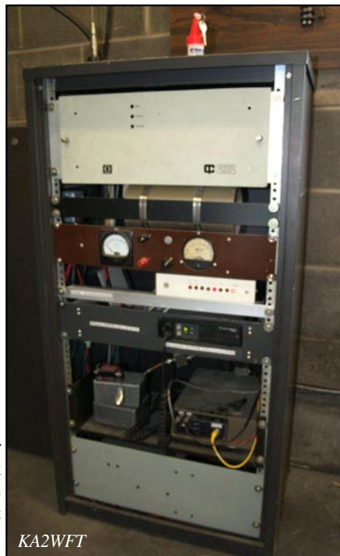
10 Meter repeater receiver and link hardware at the UB Main Street site.