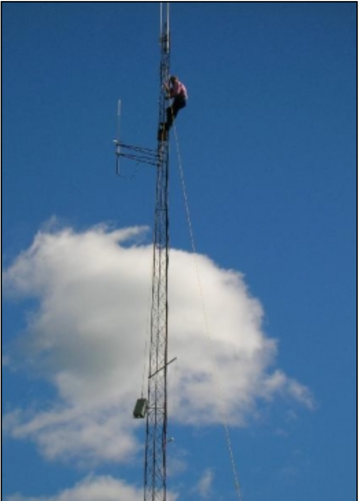
Joe Eberle, N2ZDU, high atop the Cole Road East Tower on a recent work party session.