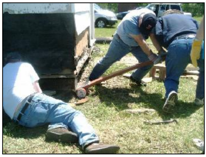
"Just lift it a bit more, guys!"