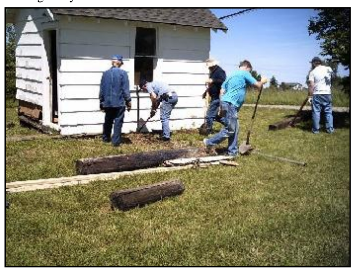
Starting to clean up the work site.