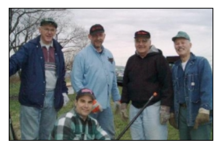
K2DSN (2nd from right) with a Cole Road work crew in April 2003