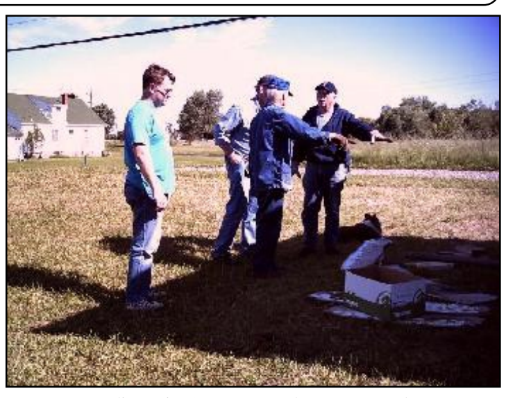
A "discussion" ensues over how to proceed next.