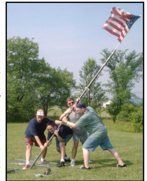
Traditional flag raising at Field Day

If you have never operated Field Day or don't have HF privileges, no problem! A control operator with HF privileges will be on duty to help you and keep you legal. As in past years we will be using the N3FJP Field day logging software http://www.n3fjp.com to track our progress over the 24 hour operation period. It was quite a bit of fun last year trying to fill in all the map sections. (See last year's map at the lower left) On-air operations will begin at 2:00 PM and end on Sunday June 25 at the same time.