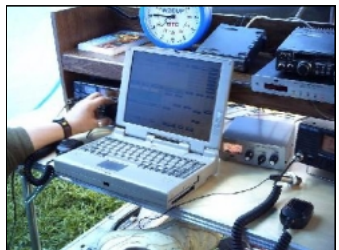
The logging computer