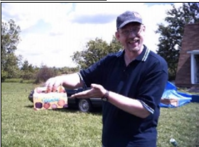
Forget the batteries, THESE are really important!