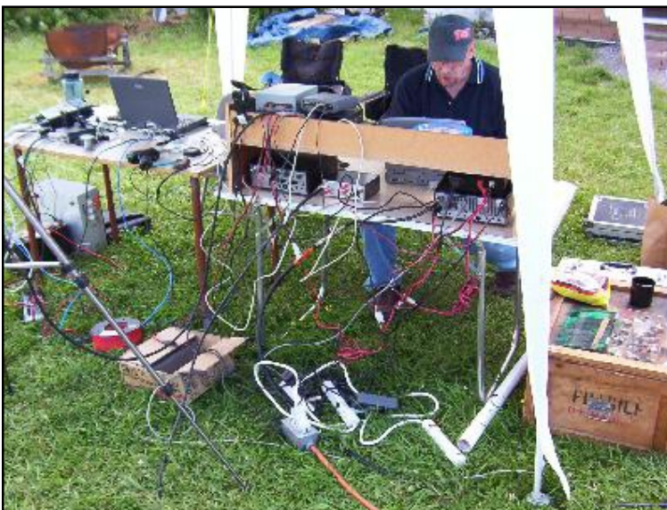
Just a few wires....