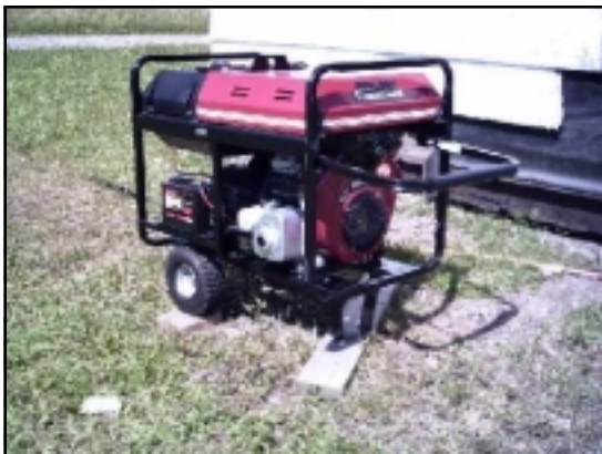
10 kW Generator arranged by Bruce, WA2HVE