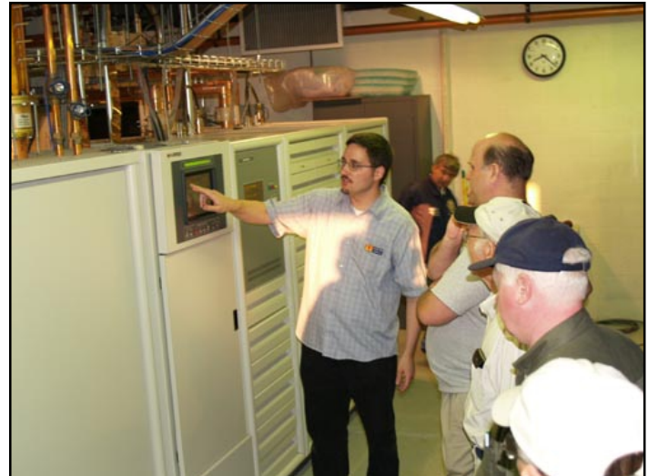
K2GTM points out the control screen of the UHF DTV transmitter.