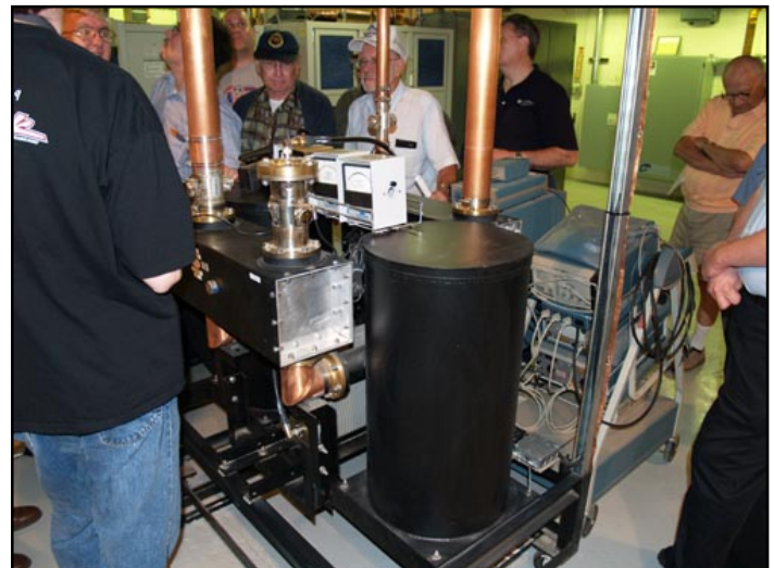
At these power levels, combiners and feedlines look more like plumbing and boilers than radio stuff!