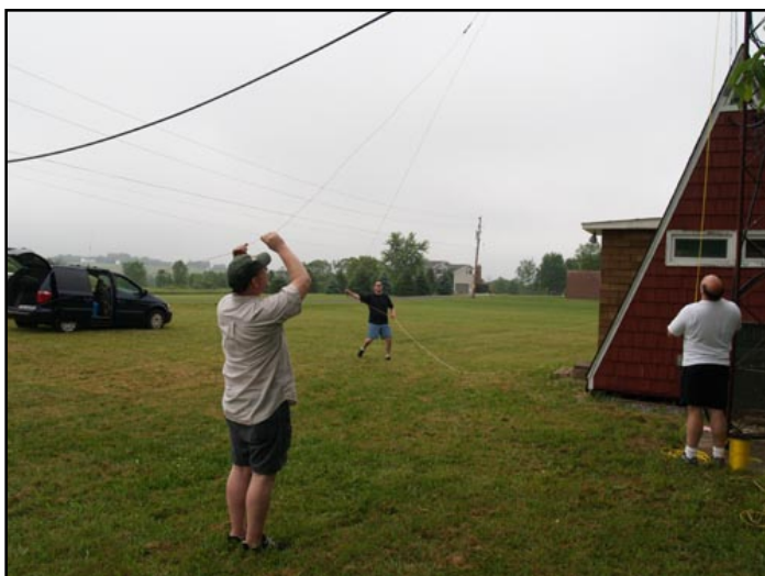
Up, up and away!