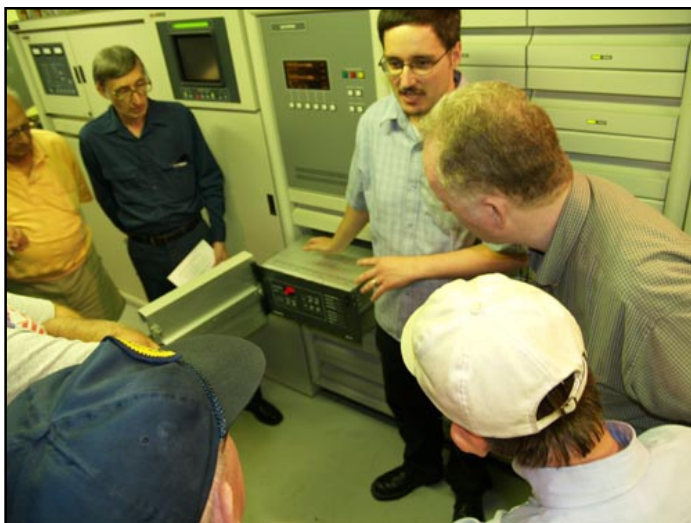
K2GTM shows the group the exciter of the VHF analog transmitter