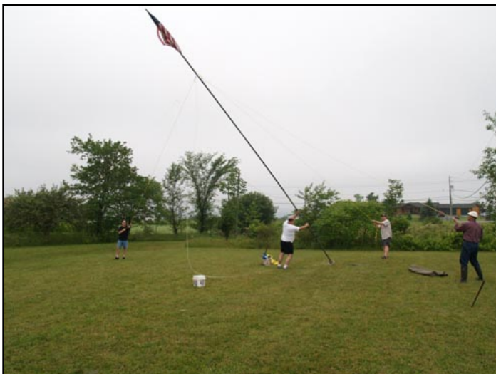
Raising the antenna mast.