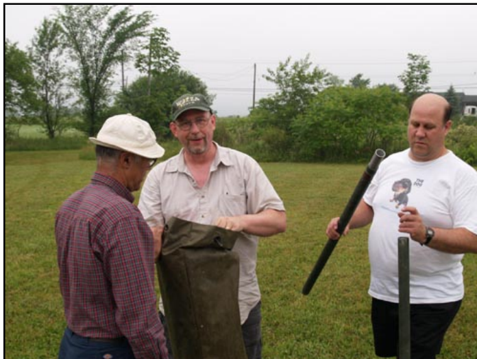
"For crying out loud, put the camera down and give us a hand!"