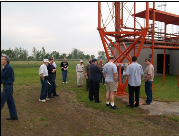
Checking out the base of the 1000-ft tower.

Some scenes grabbed by KA2WFT at BARRA's June 19th tour