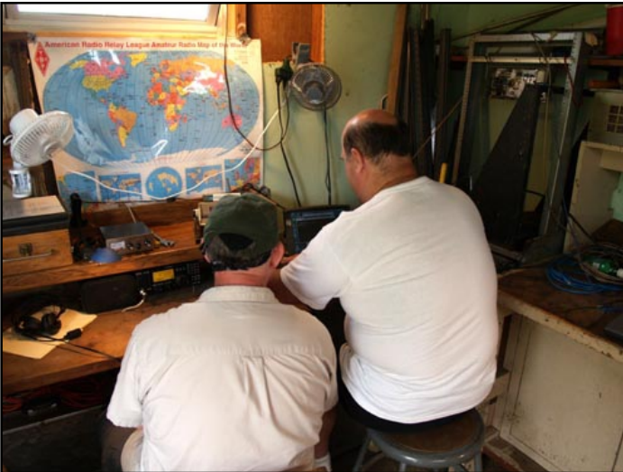
Working out a last-minute bug in the logging computers.