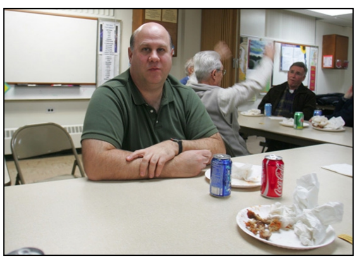
"Where's my presents?"

(Answers at the bottom of the page ... no peeking!)