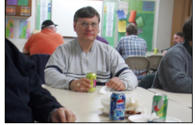
"OK, I call this meeting to order... who brought the 'N' Connectors?"