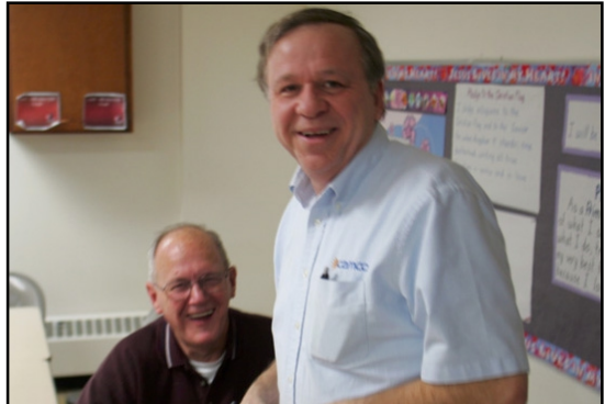
"Santa's really here? Where?"