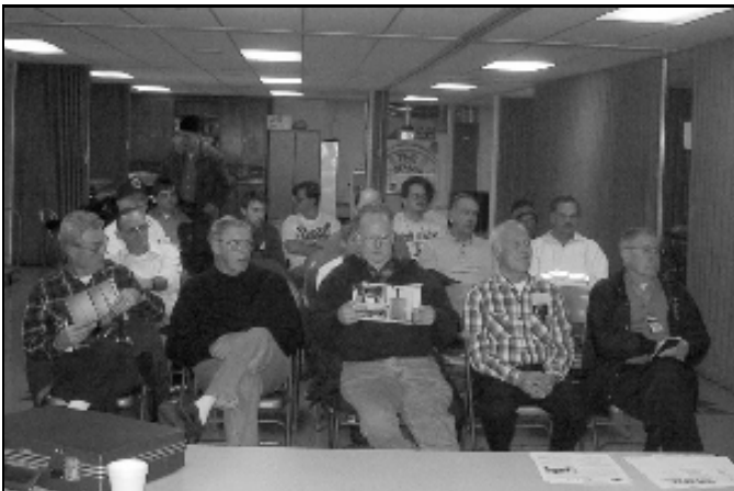
The gathered crowd at the January meeting was one of the best-attended meetings in some time.