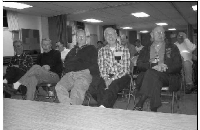
The crowd enjoys a chuckle. Maintaining repeaters can often be a thankless task, but there are often "goofy" things that happen along the way.