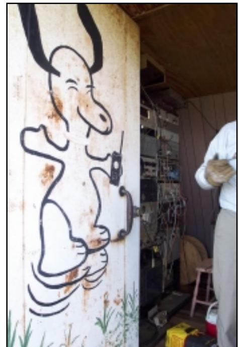
Ol' Snoopy is showing his age on the A-frame door. Is anyone with an artistic bent interested in repainting the door and Snoopy next summer?