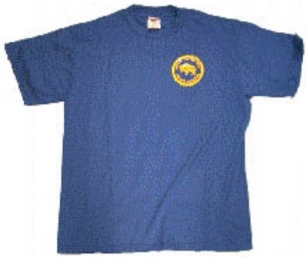
T-Shirt - $7.00