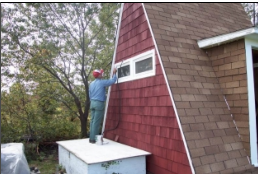
Brian, WA2CWF, gets a fresh coat of paint on the window frames of the A-frame. Note also the new roof material on the shack.