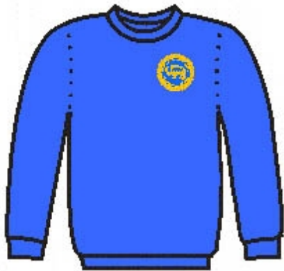
Sweatshirt - $11.00