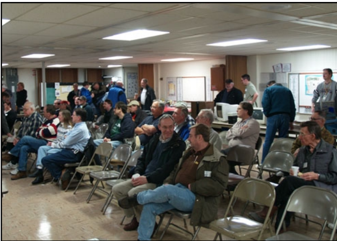
The gathered throng.

Many thanks to all who participated by buying, selling, as well as with setup and takedown.