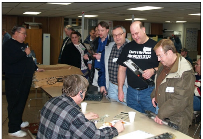
Buyers queue up for Dutch's "famous" 12V fluorescent lamps.

Many thanks to all who participated by buying, selling, as well as with setup and takedown.